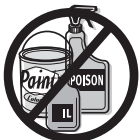
Hazardous waste including sharps (needles/syringes)