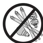
Fluorescent bulbs & other mercury containing products

Recycling opportunities for these items are provided at most Sonoma County Disposal Sites. Household toxics are only accepted at the Household Toxics Facility at Central Disposal Site.