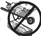
Yard debris & wood waste (including treated wood)