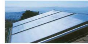
4. SOLAR THERMAL PANELS: REFER TO ROOF PLAN