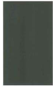
1. WINDOW & DOOR FRAMES: KYNAR 500® FLUOROCARBON ALUMINUM CHARCOAL GRAY