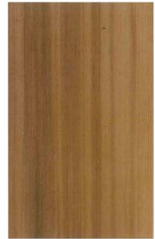
3. BUILDING SIDING: T&G CEDAR WOOD SIDING OLYMPIC STAIN