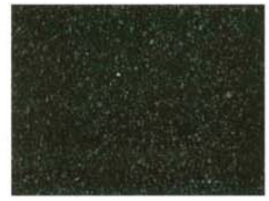
2. ROOF SHINGLES: CERTAINTED® LANDMARK™ & LANDMARK PLUS™ PREMIUM SHINGLE MOIRE BLACK (OR EQUAL APPROVED BY SEA RANCH DESIGN COMMITTEE)